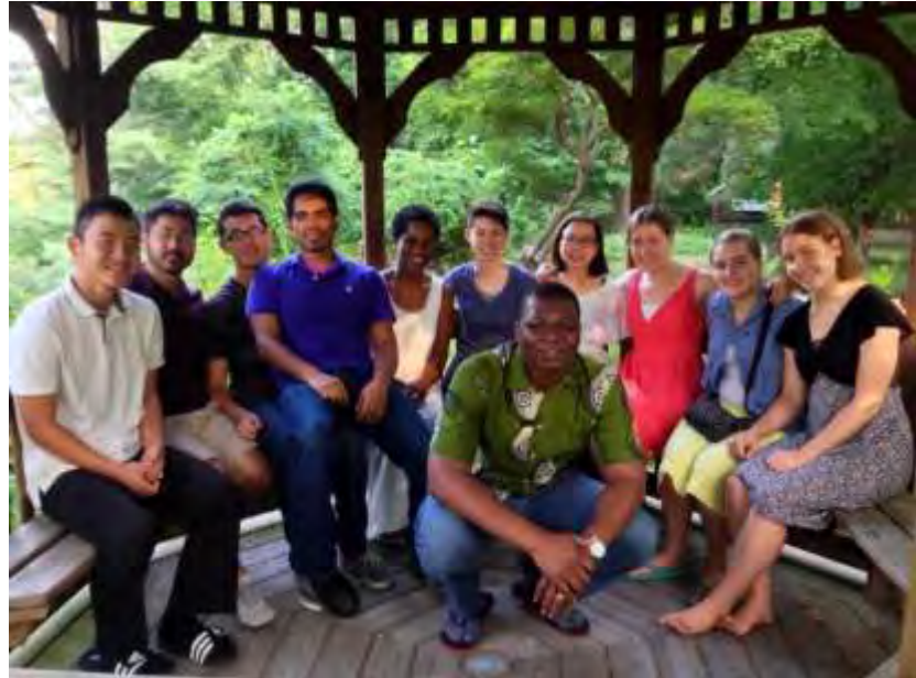
Morning Prayer Group at Barrytown College

from America and other nations interested in applying to this young, but outstanding institution of higher education.