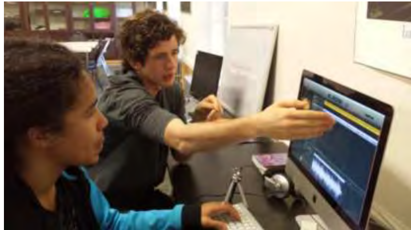
Editing in BC Media Room

One reason so many have signed the petition is that education has been precious to Americans throughout our history. The first public building erected after a church was always a school. Farmers and pioneers pooled their meager resources to hire a teacher so their sons and daughters could get an education. Community elders throughout the early Republic of the United States created seminaries, colleges and subscription schools so there could be an educated leadership to guide their communities, states and the nation.