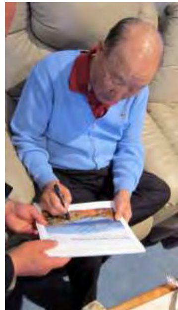
True Father Signing Barrytown College proposal in April, 2012

On the positive side, I would like to express my appreciation to the more than one thousand brothers and sisters who stood up on behalf of keeping alive Father's dream to start an undergraduate Unificationist college in Barrytown. In the last few weeks we have received dozens of inquiries from 2nd Gen