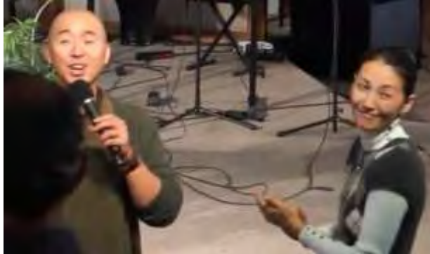
"The Eternal Kingdom" Sermon, 10/18/2015