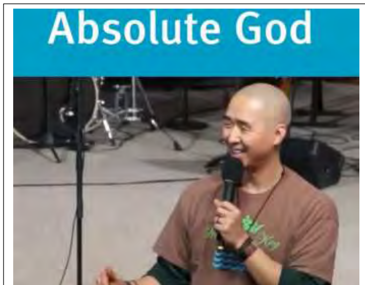
Feb. 28, 2016 Sanctuary Sermon "Absolute God"

"Yahweh Saves." You can't separate the Biblical providence from Jesus, or Father. We cannot return to God ourselves. Our love for Christ must be greater than the neo-pagan hatred of him that is rampant in our culture.