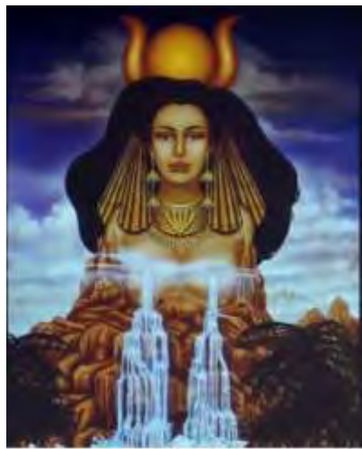
Egyptian Goddess 'Isis'

The FFWPU portrays the Old Testament God as a strict lawgiver, the God of the New Testament as "Heavenly Father" and the addition of "Heavenly Mother" as the new "revelation" of the Completed Testament Age. But five to eight thousand years ago, Hindus worshipped the "divine feminine" in the form of the goddess, Durga."