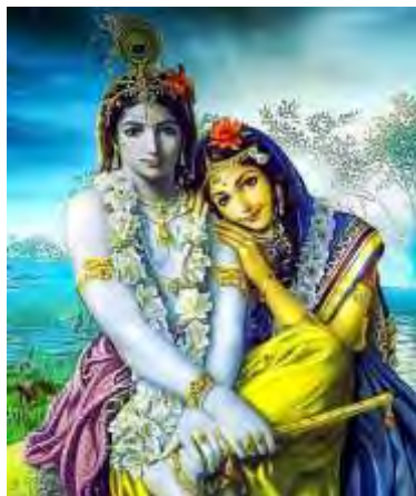
Krishna & Radha

There must be a clear heavenly hierarchy. Heavenly Father, the unique, absolute subject, gave freedom and responsibility to his sons and daughters as His gift to humanity. An equal subject "partner" who can change this direction leads to instability and loss of freedom.