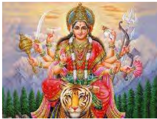
Hindu Goddess Durga

REASON why Father was the absolute subject in their home!