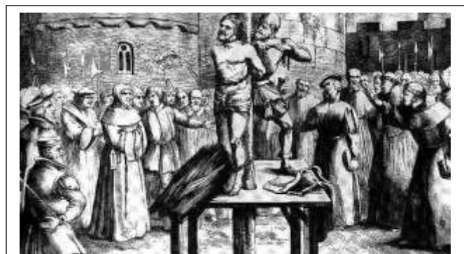
Bible translator William Tyndale burned at the stake

Consider the absurdity of trying to restrict the symbol and teachings that Father gave to the entire world and treating that as "property" that can be "owned." Who "owns" the Messiah's words? Wouldn't Father say that it belongs to those who love and practice his words the most?