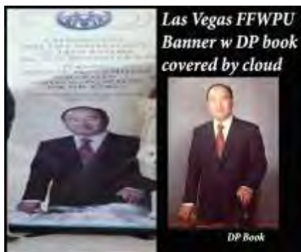
FFWPU Banner w DP Book covered