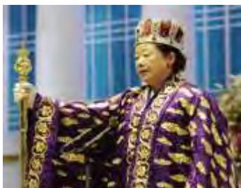
Hak Ja Han: "I have absolute power!"