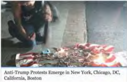
Anti-Trump Protests Emerge in New York, Chicago, DC, California, Boston

The winner of last Tuesday's election is a casino owner/media personality not dependent on bankers. Trump's campaign spent one tenth of what Hilary spent on her campaign. He was opposed by elites in both parties. Even now, "spontaneous" demonstrations funded by billionaire George Soros in many cities around the country seek to undermine this victory reminding us that it is not the conclusion of a worldwide ideological war between socialism and national sovereignty based on personal freedom and responsibility, but rather the end of the beginning.