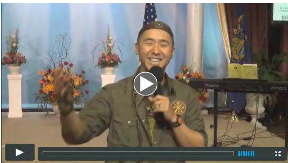
Kingdom of the Rod of Iron 7 - March 4, 2018 - Rev. Hyung Jin Moon - Unification Sanctuary, Newfoundland PA

God works in mysterious ways when you are united with the True Father, the King of Kings! The liberal media that intended to shame and discredit the Unification Sanctuary actually helped to spread information about our gospel worldwide. News is spreading worldwide by the power of God. People are contacting us and asking to participate.