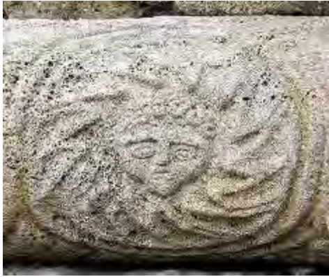
Medusa image from Chorazin synagogue

Perhaps one of the reasons that the Jewish inhabitants of these towns ignored Jesus' words and miracles was their involvement with pagan practices . The synagogue in Chorazin, built a few generations after Jesus' ministry, had an image of the Greek monster Medusa embedded in its walls!