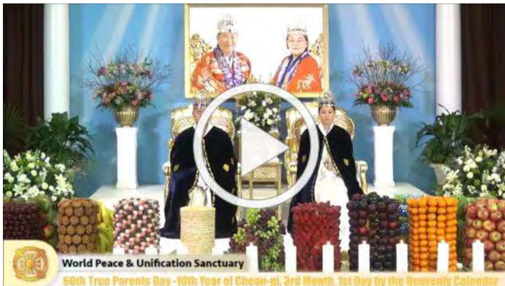
60th True Parents Day, April 5, 2019 Unification Sanctuary, Newfoundland, PA