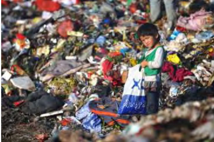
Venezuelan child scavenging for food in garbage landfill

More recently, voting for a charismatic leftist who inveighed against "greed" didn't turn out so well for the people of Venezuela. Under the banner of fighting "violence" and "crime," Chavez, the "compassionate leader" of the socialist government, banned the sale of firearms and ammo in 2012 . The murder rate increased and Venezuelans were left defenseless against a government that runs roughshod over their civil liberties while destroying their economic livelihoods. Starving citizens live in fear of the constant threat of colectivos , Venezuela's bullying, paramilitary units who of course have- you guessed it- guns.