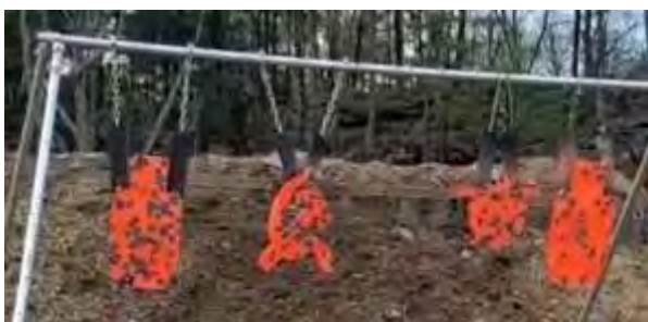
Communist Targets Afterwards

As described in Zechariah 5, the basket (epha) with a lead lid contains the Babylonian harlot. It is a prison for the fallen Eve who does not value her husband and commits adultery with the archangel. Hitler had to target women, preying on their fears saying, "if your husband dies or does something bad, we will take care of you." But if you unite with centralized government you have given yourself over to evil and immorality.