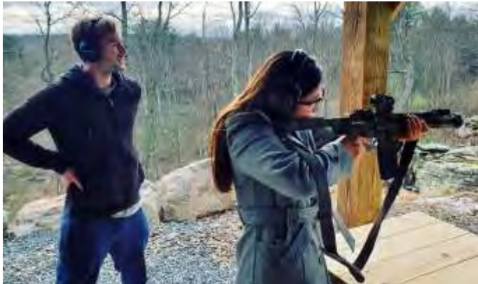
Shooting Communist targets after Service

There is a long tradition of religious leaders taking up arms. Many pastors fought in the American revolution. The rod of iron is a blessing to the people, but a curse to the predator class. Responsible use of force is a line holding back totalitarian takeover, but in many countries they lack that and have no way to regain their freedom.