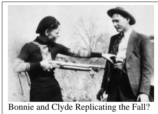
Bonnie and Clyde Replicating the Fall?

I imagine that this new teaching could be attractive to Leftists who believe that private property is evil and want government to confiscate wealth in order to redistribute it to preferred groups. Concentration of power has always been a key objective of centralized tyrannies.