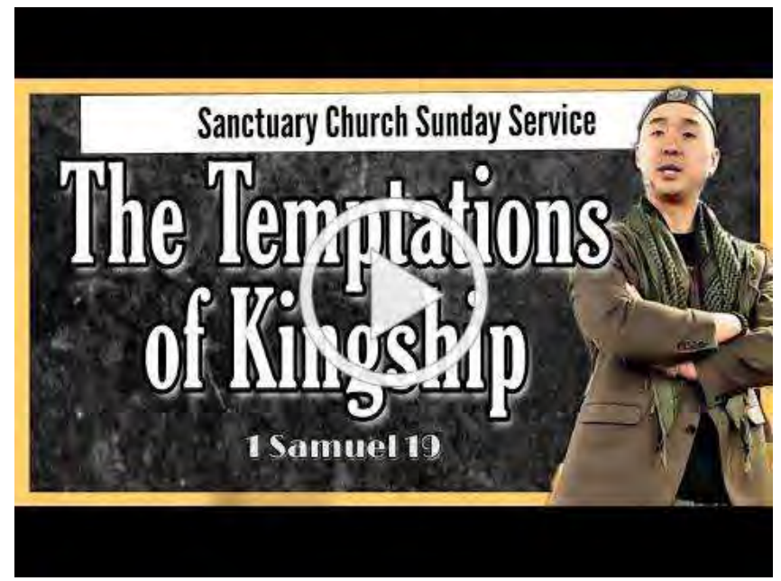
The Temptations of Kingship (Sunday Service 12/8/19)

Natural Law is based on the idea that everything has a proper function. Good is tied to proper purpose and function. The purpose of our sexual organs is obviously reproduction. It also unites male and female into a "comprehensive unity" meaning mind, body, soul, and destiny. Homosexual relationships do not fulfill either purpose. People who are naturally un-fertile are not changing the original purpose and function.