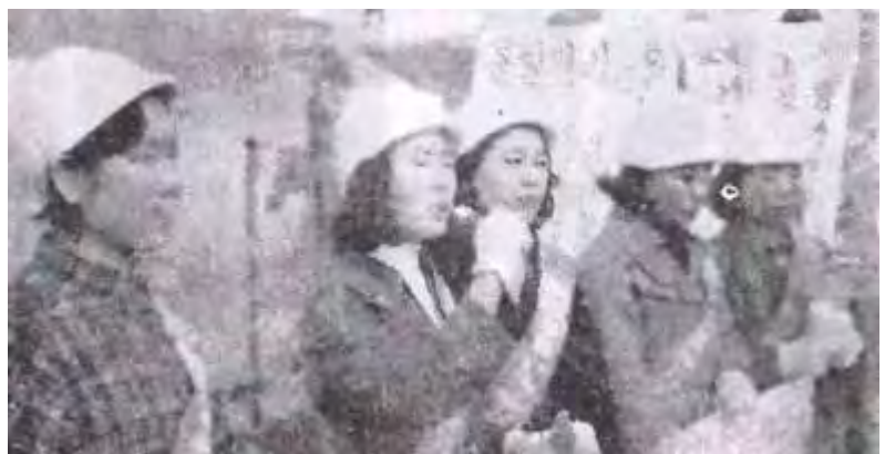
"What is the Divine Principle?"

Apart from individual targets they may have set to earn money for the new building, they have, as a team, a goal of bringing in twelve new members by the time that our Leader returns to Korea.