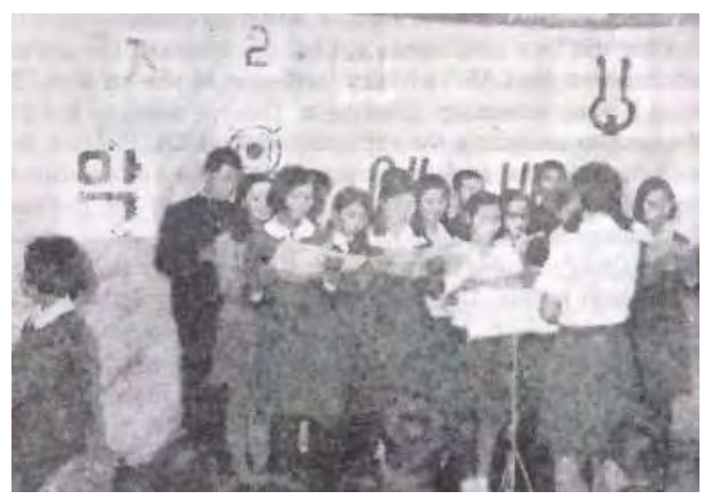
Special Wednesday evening service for middle and high school students

They meet in the student hall on Saturday afternoon and come to the church very often. The women leaders for the girl members and men leaders for the boy members are usually in their mid-twenties. They try to meet the school children as possible in order to guide them and create better relationships.