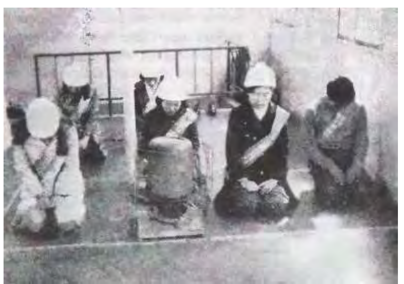
On a winter's day, some Kidongdae members prepare for work

Kidongdae is a Korean term used to describe an army or other unit that has been specially trained and is ready for action at any time.