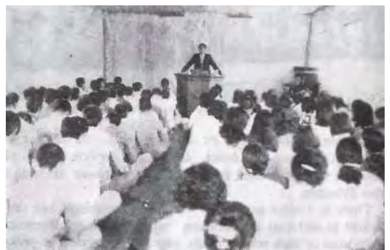
"Let us Emulate the Forgiveness Shown to Us by the Messiah."