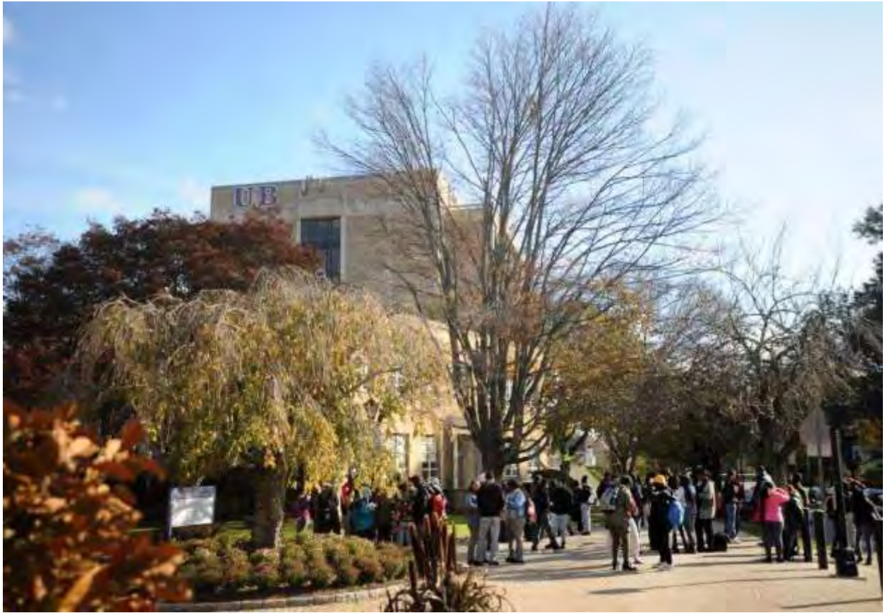
The University of Bridgeport campus in Bridgeport, Connecticut