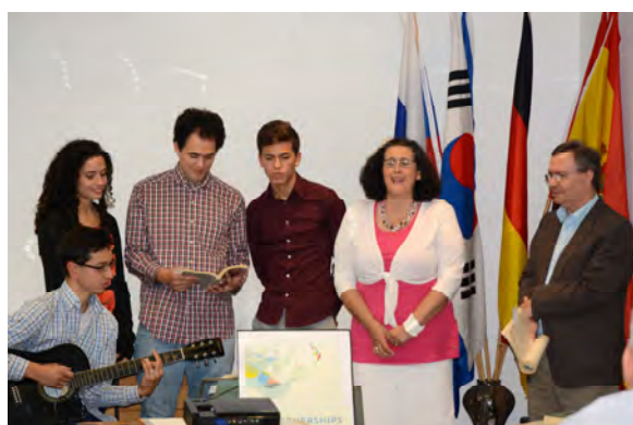
United Family – Unites Nations