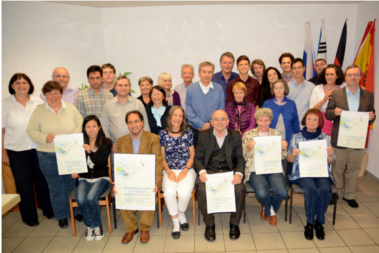
„Partners for Peace“ – Participants of the World Peace Day

Another topic was the aid for Nepal after the Himalayan nation was struck by devastating earthquakes in spring. Members of UPF International not only donated food and material goods but also provided human help by meeting the people in need on site.