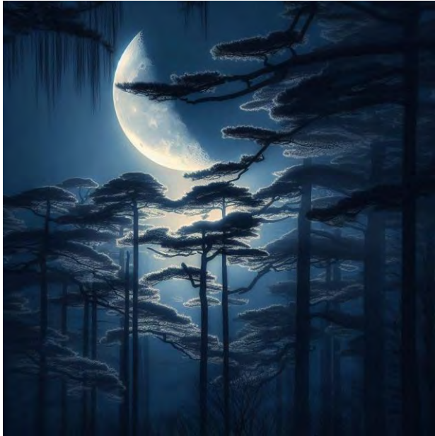
Half-moon shining through pine trees.

We have to take care, like Mother Moon says, of our health. We should really think deeply how and what we eat, so that we can contain our health and thus fulfil with a healthy body the work of our Heavenly Parent.