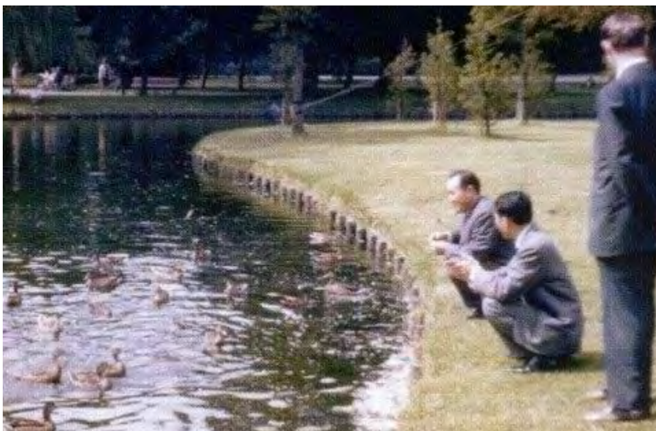
Sun Myung Moon feeding ducks in Berlin in 1965

Let us cultivate a habit of gratitude, acknowledging the earth's generosity and committing ourselves to its preservation. In that sense, I learned so much from our True Parents . I remember when they were in Switzerland, how much they loved the beautiful mountains there.