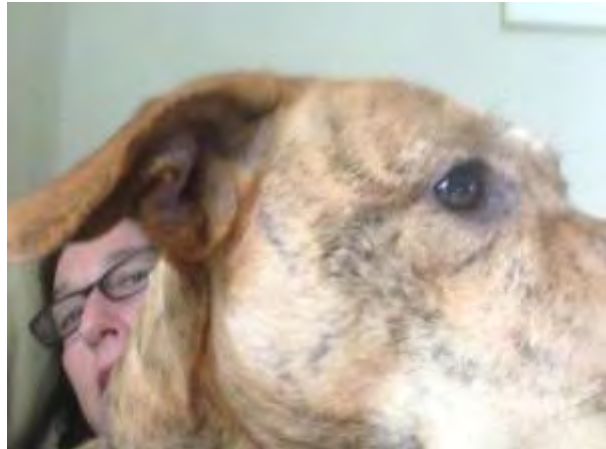
Caryn and Thrax

Depression is such a heavy emotion and its cause is often not explored enough. Taking it to the extreme is the act of suicide-when the hopelessness builds to a point of excruciating, numbing pain. There is no light and no hope. Oftentimes, the spiritual aspect of depression is ignored, and doctors prescribe anti-depressants, which have potentially deadly side effects.