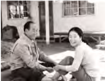
In the early days in Korea