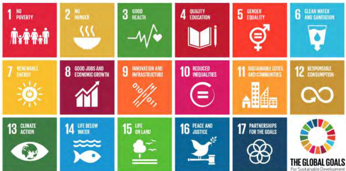
Chart of the Sustainable Development Goals for the next 15 years until 2030

Click here to register for the Dinner Event. Registration will close when all seats have been filled. We hope many of you will be able to make use of each of these wonderful opportunities to experience our international level of activities, and also as a chance to meet our WFWP team.