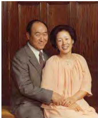
Father and Mother Moon earlier years