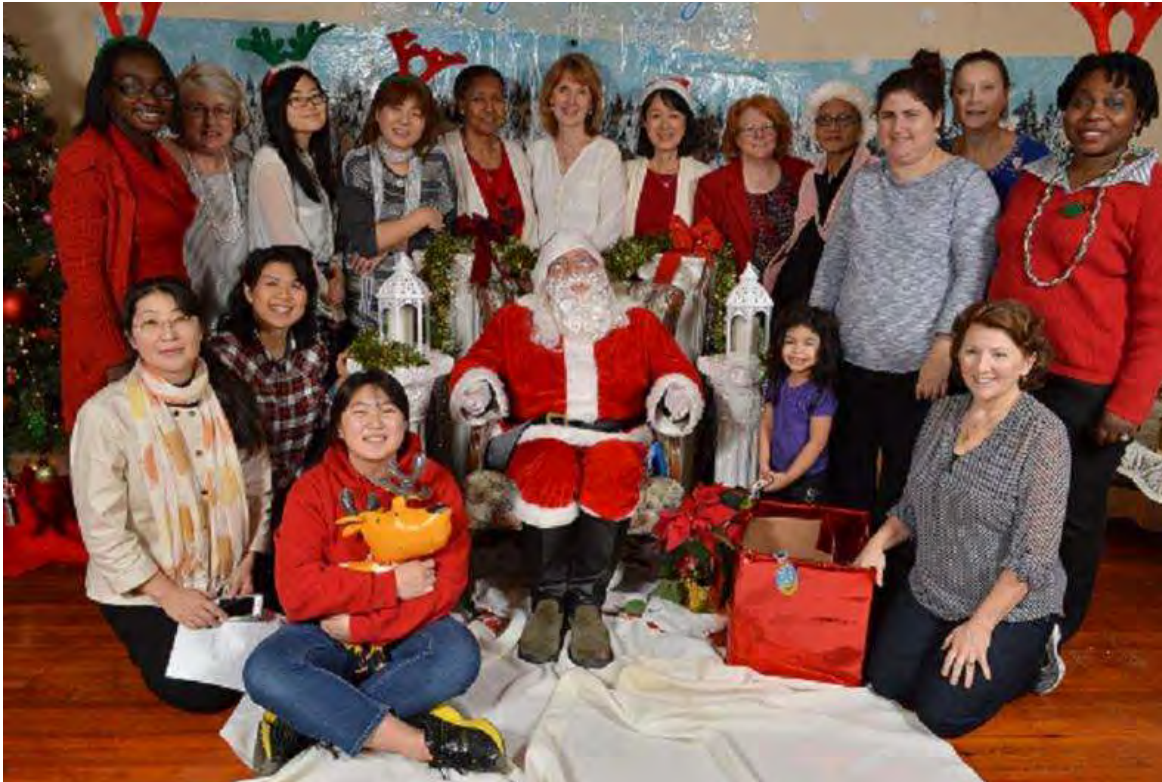
New Jersey Chapter of WFWP held a bazaar to support Schools of Africa Project in December 2015