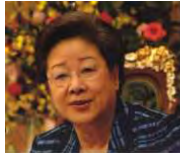
Mother Moon speaking tour