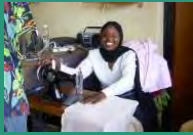
Education, equipment... economic independence!