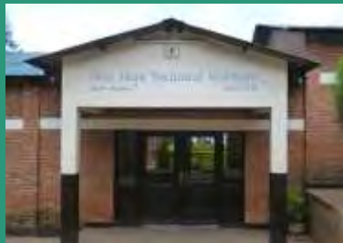
New Hope Technical Institute, first campus