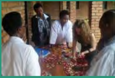
Dressmaking with a professional designer