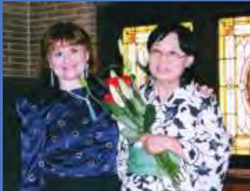
Love and healing for Japan

Yes! I want to give to create genuine peace