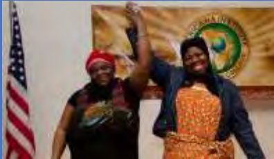
Love and healing for Africa