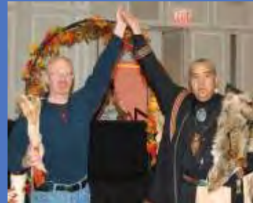
Love and healing for Native Americans

WFWP works for sustainable peace, through our Leadership of the Heart education, through our Cornerstone for Happiness relationship education, and by building bridges and overcoming historical barriers.