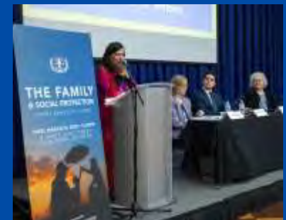
WFWP panel at the annual UN Commission on the Status of Women

WFWP works for sustainable peace, through our Leadership of the Heart education, through our Cornerstone for Happiness relationship education, and by networking with like-minded organizations to strengthen our impact.