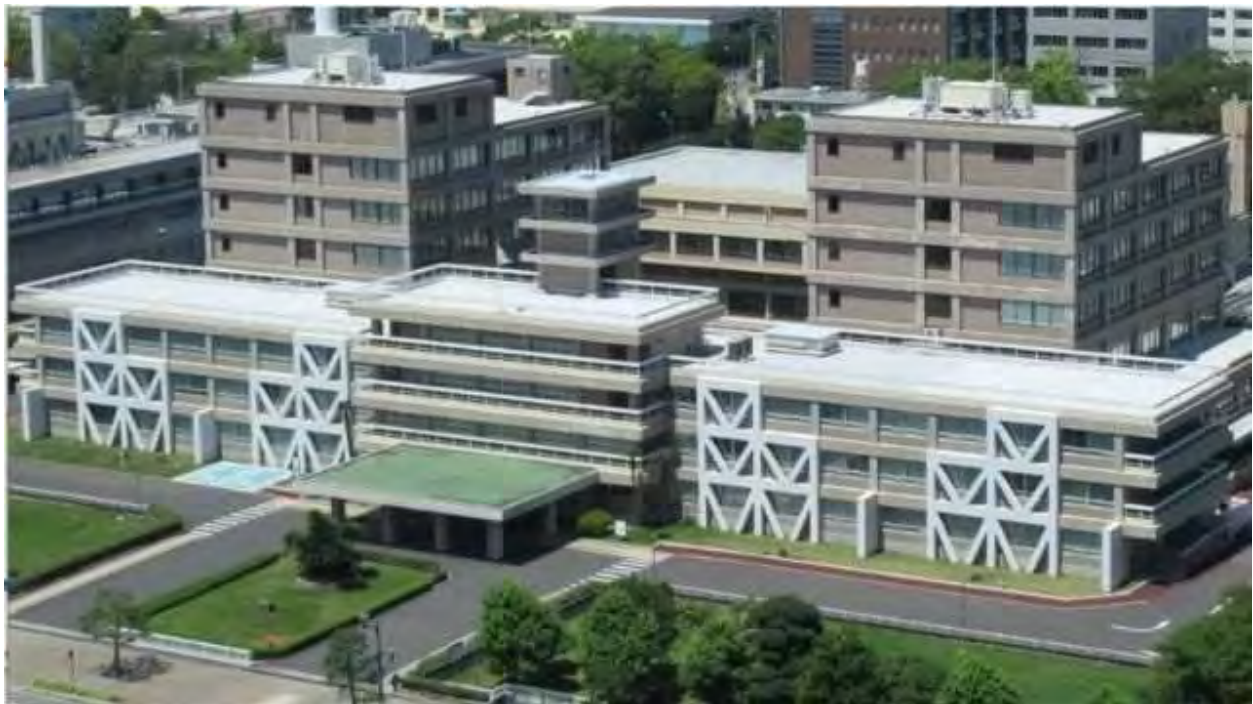
The Hiroshima High Court.