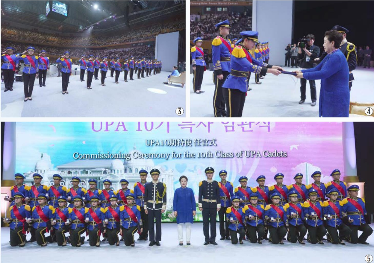
①True Parents speaking ②Presentation of flower bouquets ③④⑤UPA 10th Class Special Envoy Commissioning Ceremony ⑥Heavenly

Anthem, recitation of the Family Pledge, and a reporting prayer by South America Regional