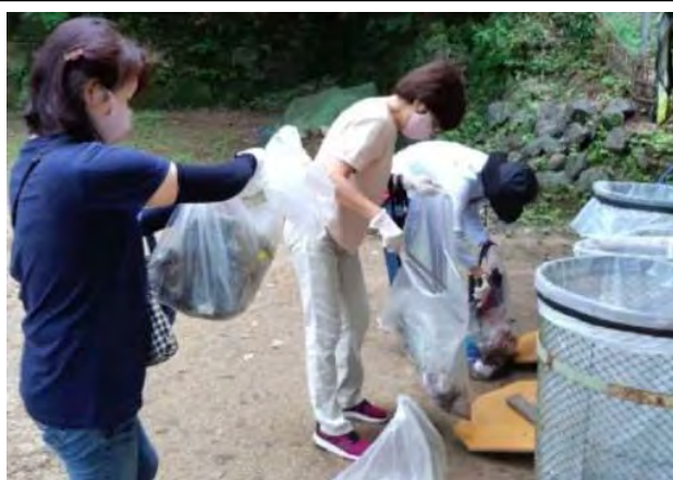
Volunteers from WFWP Japan have been cleaning up Marugame Castle in Kagawa Prefecture for seven years continuously

We know, the anti-Unification-Church camp loudly proclaims that "the damage caused by the former Unification Church is serious and continues to this day." But they have not proved this to be true.