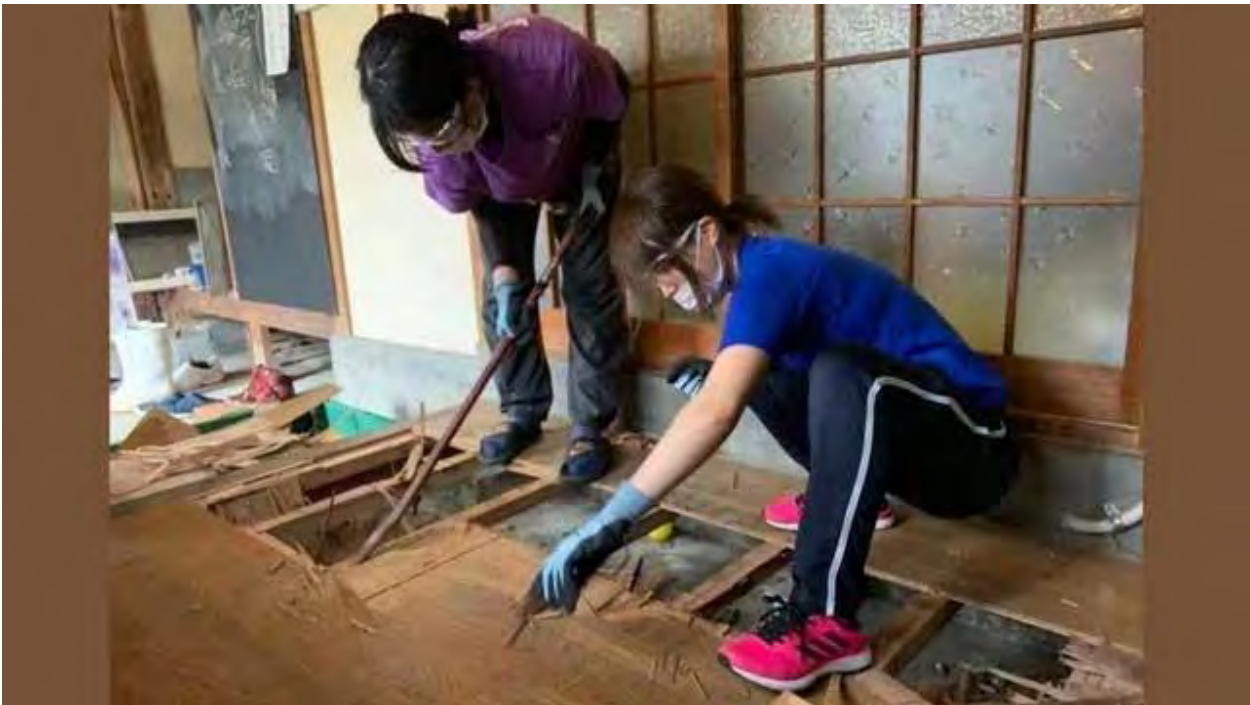
Youth members of the Women Federation for World Peace (WFWP), an organization connected with the Family Federation and heavily discriminated in Japan after the Abe assassination, help in a disaster area in the northern part of Kyushu in Japan damaged by the 2017 heavy rain.

Even those Family Federation members who perform valuable volunteer work have been harassed based on dubious theories spread by anti-cult lawyers. Original Story