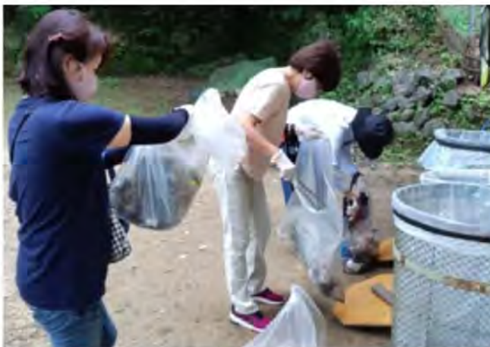
Volunteers from WFWP Japan have been cleaning up Marugame Castle in Kagawa Prefecture for seven years continuously.

We know, the anti-Unification-Church camp loudly proclaims that "the damage caused by the former Unification Church is serious and continues to this day." But they have not proved this to be true.