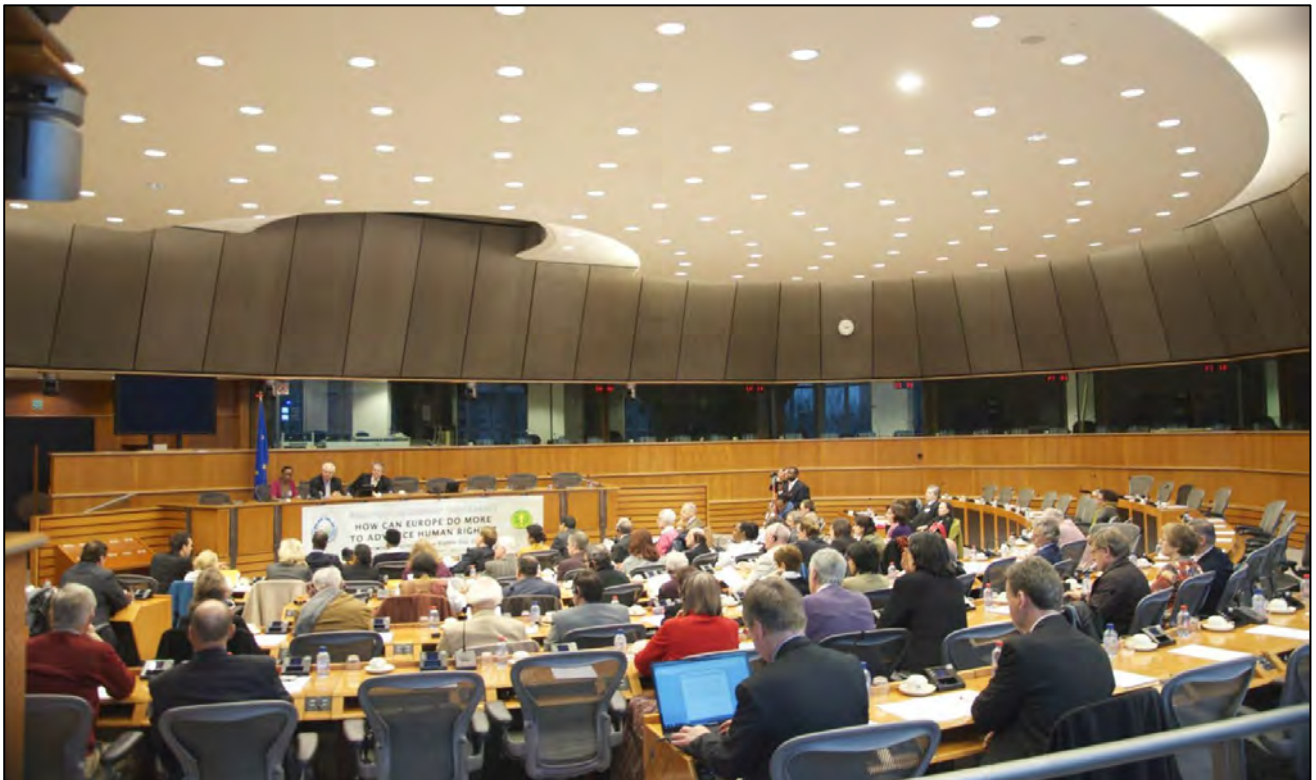
European Parliament, where the final 2 sessions of the conference were to take place