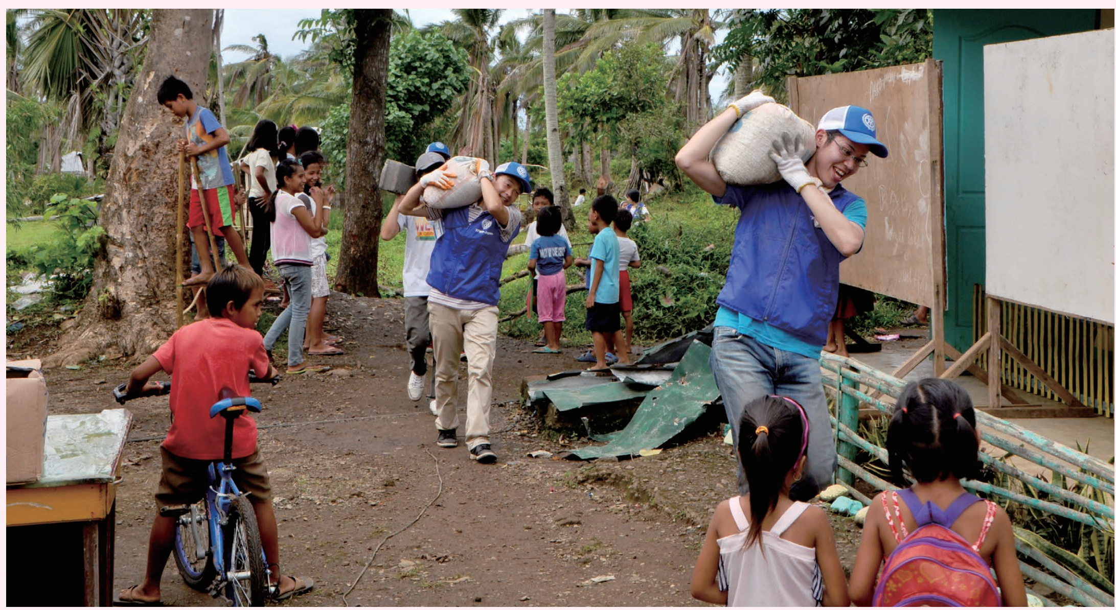
Service project in cyclone-devastated Munroi Elementary School