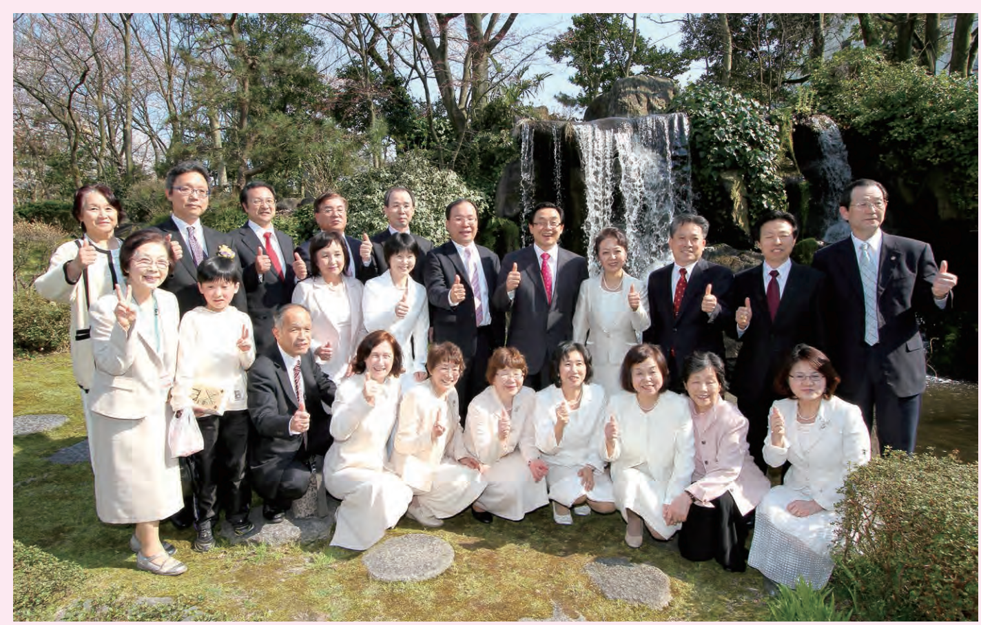
In the garden of Hotel Kangetsu, designed after a heaven's image