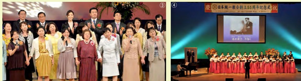
③ CIG members sing "Mimune no Ouenka" ④ Saecheonji Choir sings "Song of the Heavenly Soldiers"