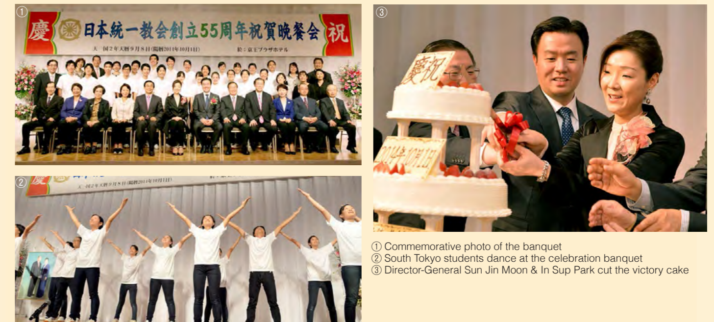
① Commemorative photo of the banquet ② South Tokyo students dance at the celebration banquet ③ Director-General Sun Jin Moon & In Sup Park cut the victory cake