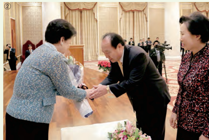
① True Mother emphasized the Heavenly Tribal Messiah's mission ② Presentation of flowers to True Mother ③ Special Meeting to accomplish the Heavenly Tribal Messiah's mission (Nov.12, at Cheon Jeong Palace)