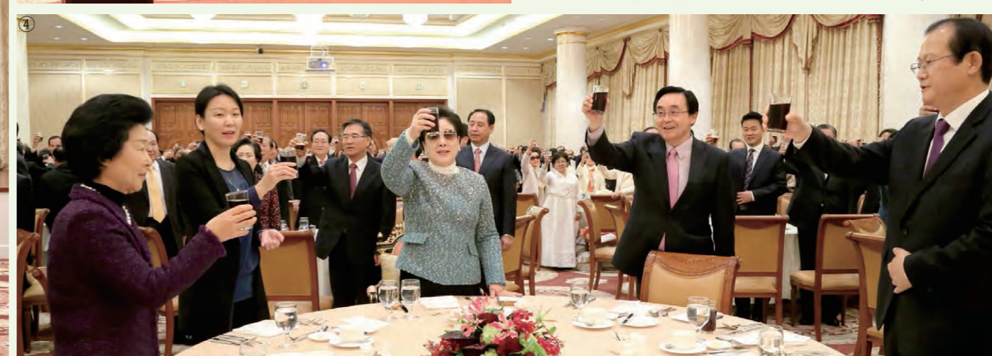
①② True Mother spoke at the Special Meeting ③ True Mother gave word of encouragement to participants ④ True Mother (center) made a toast at the luncheon banquet