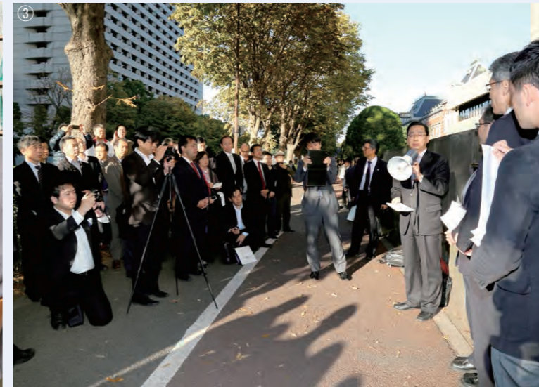
① Supporters gathered in front of the court ② Interview at the judicial press club ③ Supporters gathered in front of the Tokyo High Court