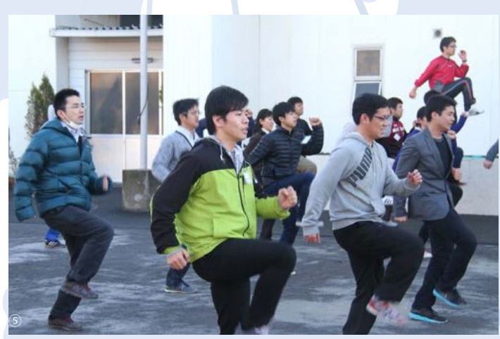
① Trainees holding their graduation certificates ② Trainees singing 'Space Battleship Yamato' at the closing ③ Early morning prayer in Inage Beach, Chiba ④ Trainees pose before the statue of Shigenobu Okuma, Waseda University founder ⑤ Trainees practice Bounce dance