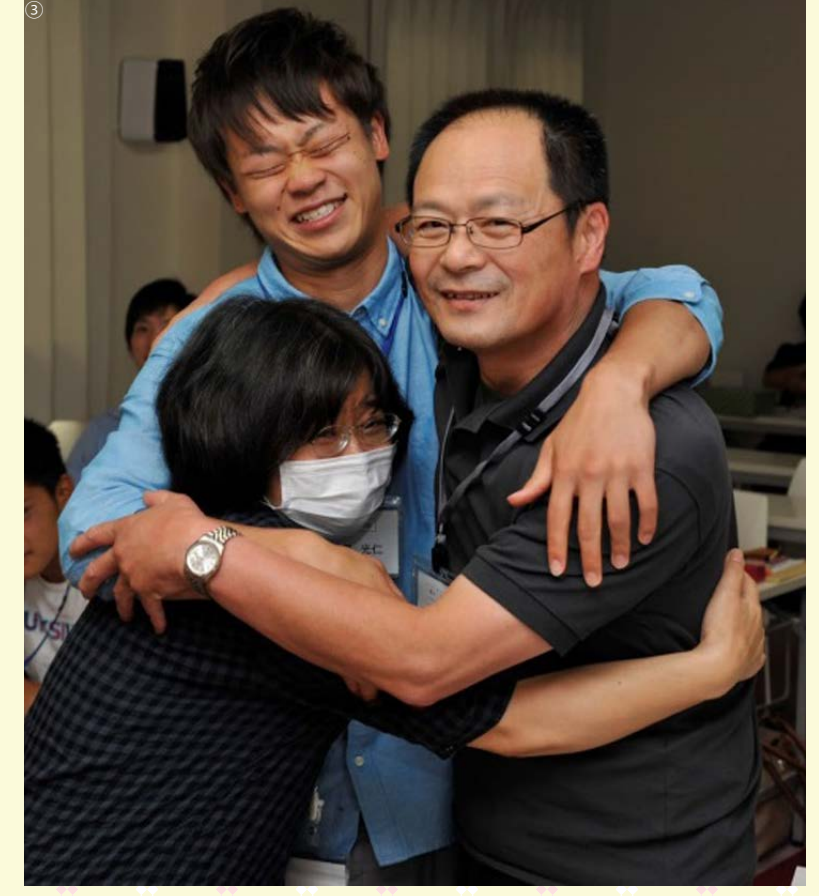
① A parent and child offer prayer hand in hand ② A mother reads a letter to her child in tears ③ Parents in the Parents-Children Seminar with their son

The bigger the parents' desire for their child to change, the more they cling to their present behavior. This way, the parents' image toward the child grows worse. In most cases, parents' efforts to change their children work in negative ways. So, how must parents change?