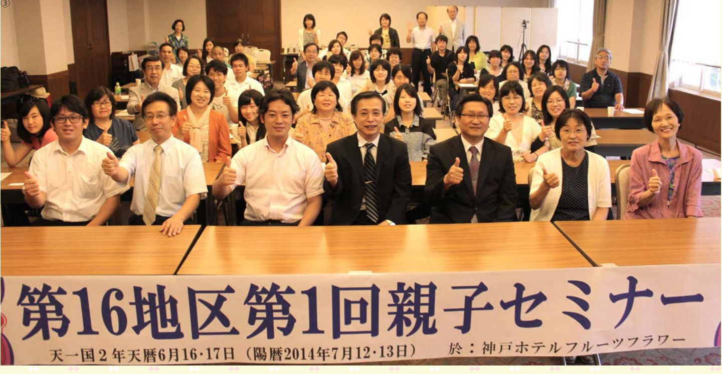
① Participants of Parents-Children Seminar ② Participants of Parents Seminar listening to lecture ③ Participants of Parents-Children Seminar

First, parents' love must reach children. It is to deepen their give-andreceive action. Parents' loving of children and parents' love reaching their