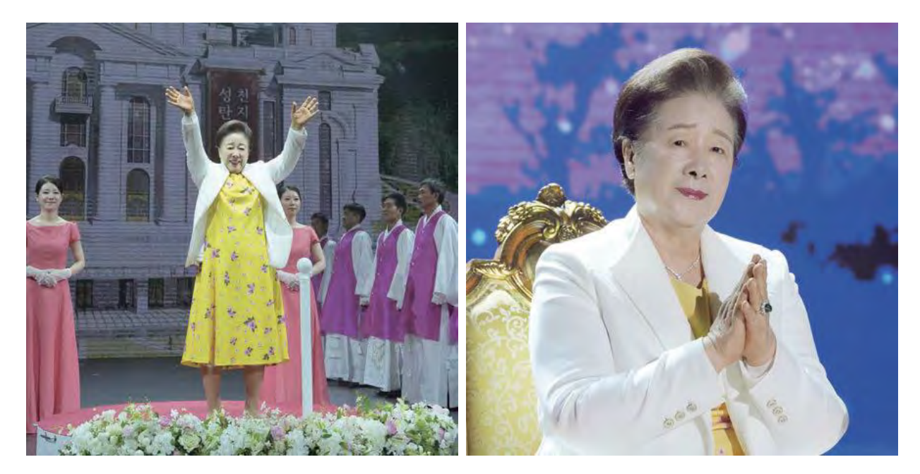
The ceremony began with the True Mother's arrival, greeted by a standing ovation. Seven representative couples experienced the holy water ceremony, personally conducted by the True Mother, signifying purity and blessing.

The second part of the celebration, the Heavenly Top Gun Special Blessing Ceremony, was solemnly officiated by the True Mother. Seventy main couples, destined for missions in various countries including the United States, Canada, and Great Britain, participated in this sacred event.