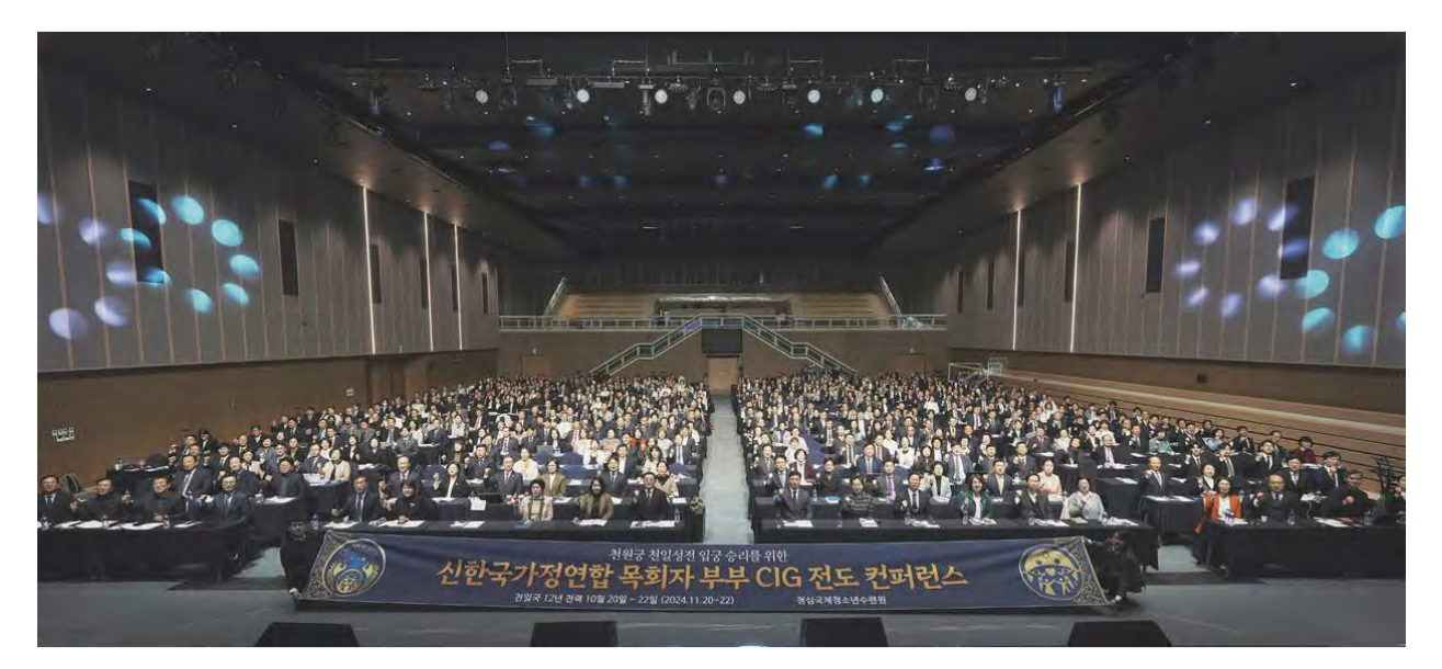
Over 600 Pastors and district officials convened at the Cheongshim International Youth Training Center and HJ Heaven and Earth CheonBo Training Center for a three-day conference from November 20-22

The gathering focused on enhancing outreach capabilities, engaging in in-depth discussions about vision and practical methods for strengthening witnessing capabilities.