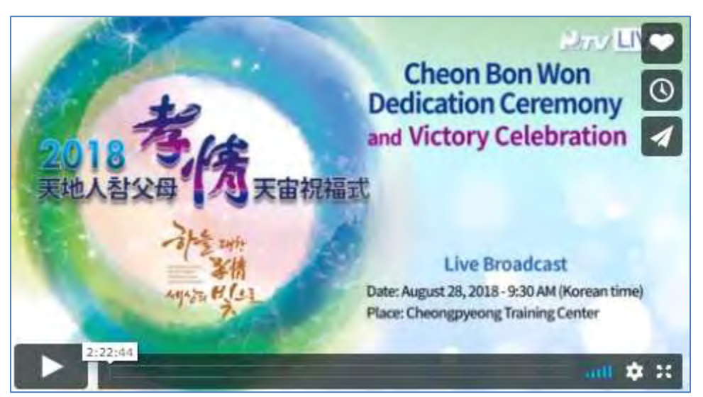
2018 – 180828 – Cheon Bon Won Dedication Ceremony and Victory Celebration

The first 15 minutes of the video below is the Opening and Dedication Ceremony of the new Genealogy Centre: