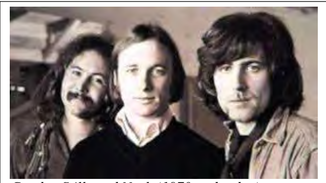
Crosby, Stills and Nash (1970 and today)

and work 16 hour days in order to resurrect America.