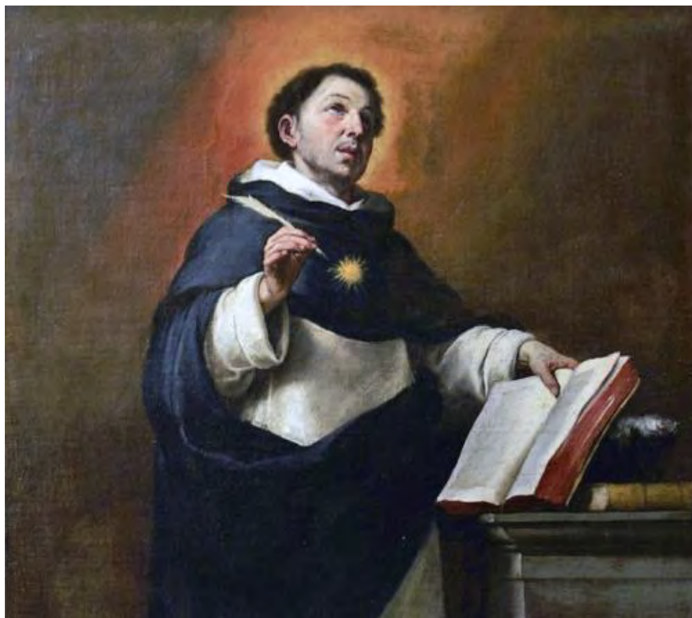
"Thomas Aquinas" by Bartolomé Esteban Murillo, 1650.

Moon's speeches, Mother Moon's speeches. Revelation defines our primary corpus, our collection of scriptural writings, and it is an ongoing process that gives us more and more access to God's heart, to His will.