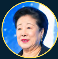
Dr. Hak Ja Han Moon Host, Rally of Hope Co-Founder, Universal Peace Federation