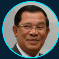
H.E. Hun Sen Prime Minister Kingdom of Cambodia