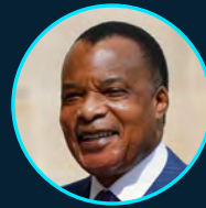
H.E. Denis Sassou Nguesso President Republic of the Congo