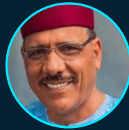
H.E. Mohamed Bazoum President Republic of the Niger