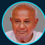
H.E. H.D. Deve Gowda Prime Minister Republic of India (1996-1997)