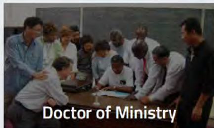
Doctor of Ministry