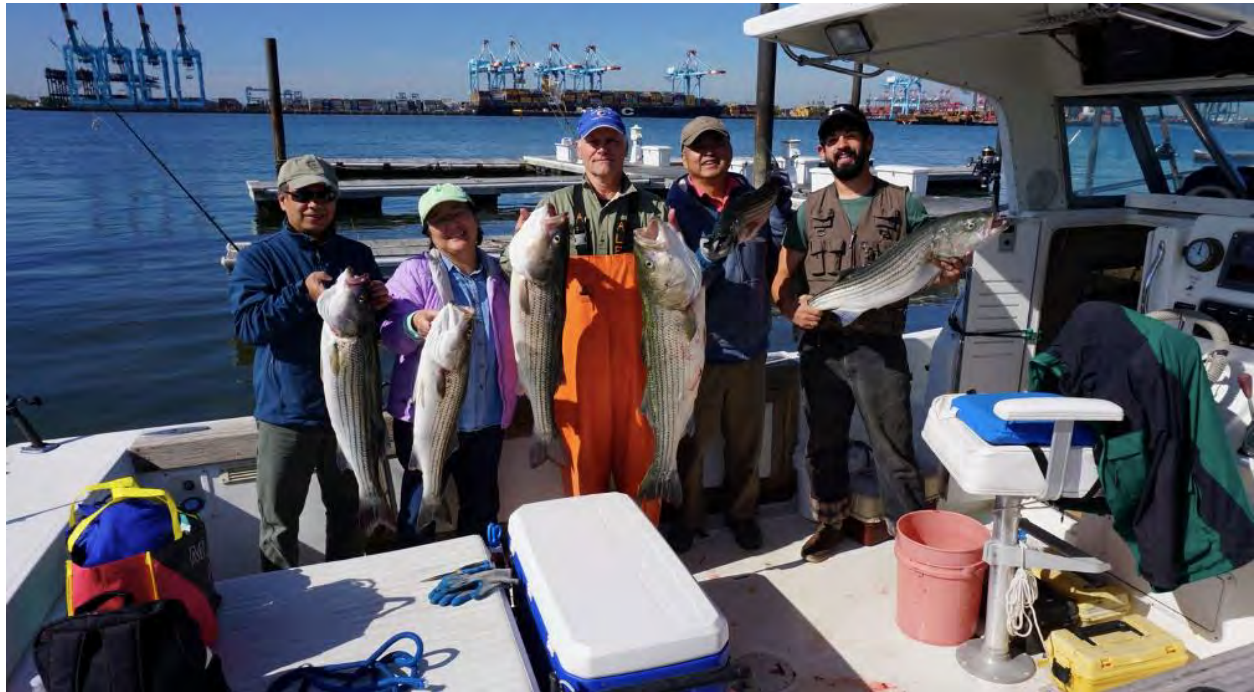
Ocean Church crew catch fish in the New York Bay and East River (FFWPU USA, November 2016)