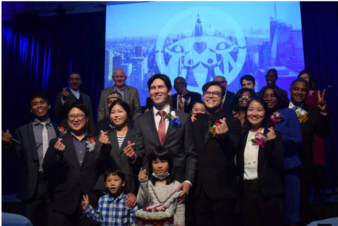
New Manhattan Family Church Pastor!