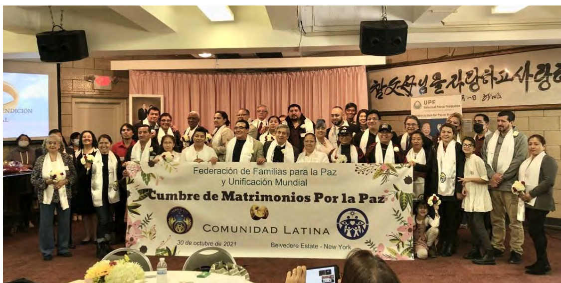
Latino Marriage Blessing Seminar