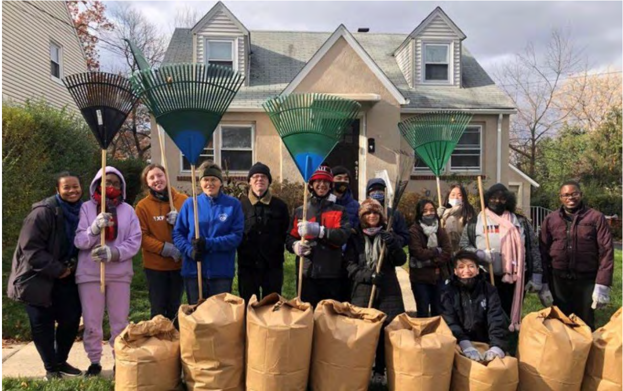
YSP New Jersey