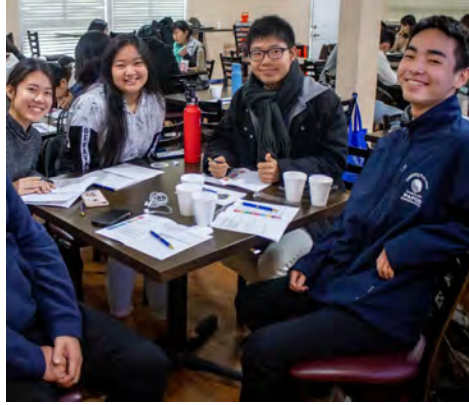
Peace Designer Seminar