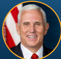
Hon. Mike Pence Vice President of USA (2017-2021)