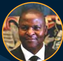
H.E. Faustin Touadera President of Central African Republic