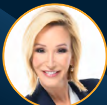
Pastor Paula White Spiritual advisor to President Trump