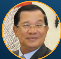
H.E. Samdech Hun Sen Co-chair, World Summit; Prime Minister, Kingdom of Cambodia