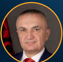
H.E. Ilir Meta President of Albania