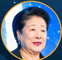
Dr. Hak Ja Han Moon Founder Host World Summit 2022