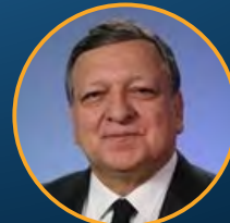
H.E. Jose Manuel Barroso President of the European Commission (2004-2014)