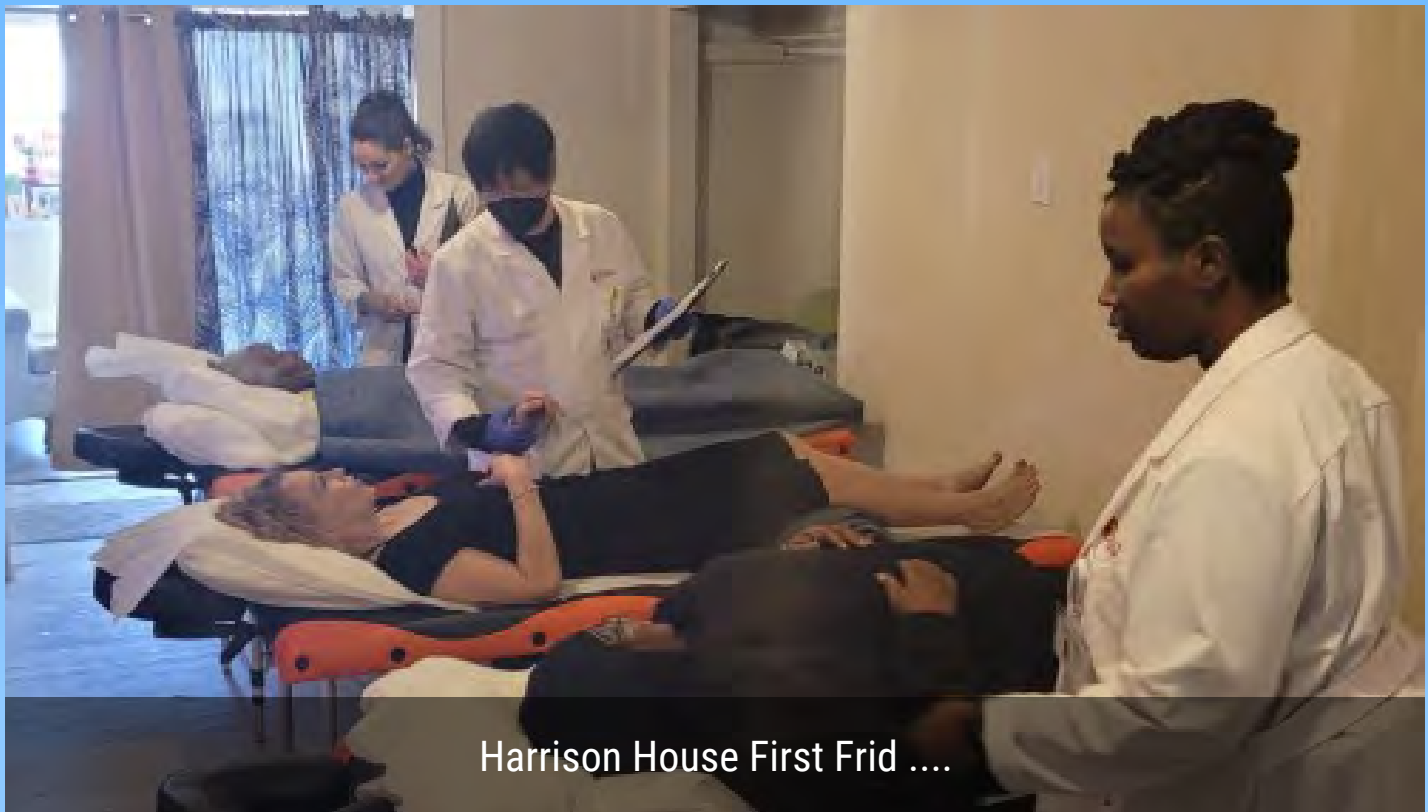
Harrison House First Frid ....