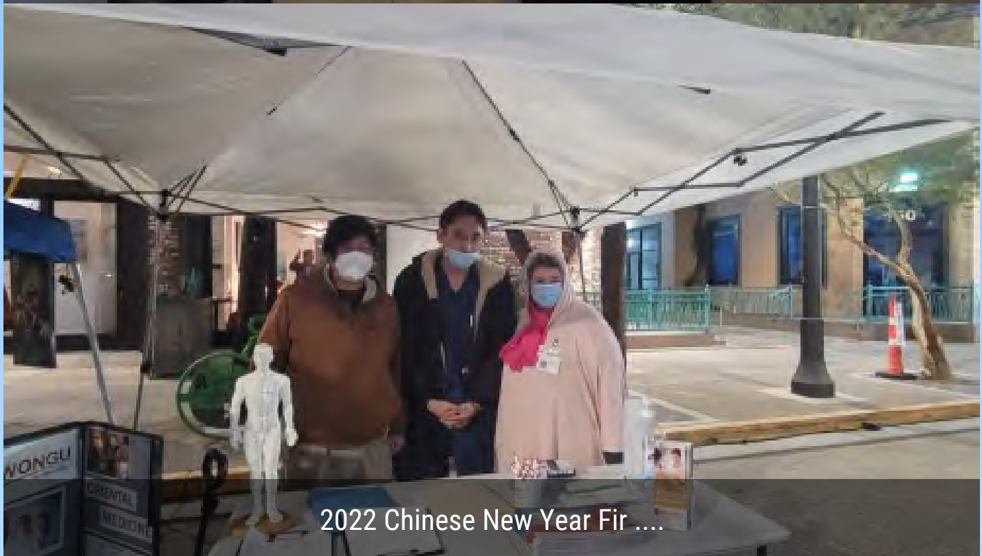
2022 Chinese New Year Fir ....