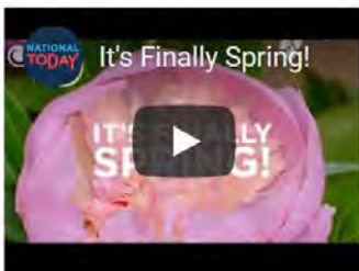
It's Finally Spring!