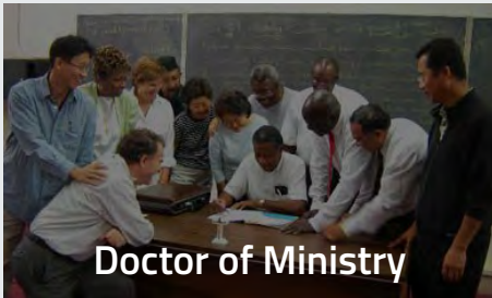
Doctor of Ministry