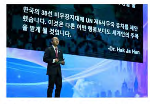
CARP Student Represents North America for International S!NERGY Competition