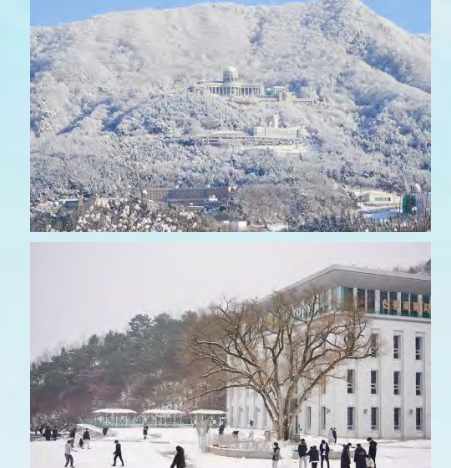
CheonBo Training Center