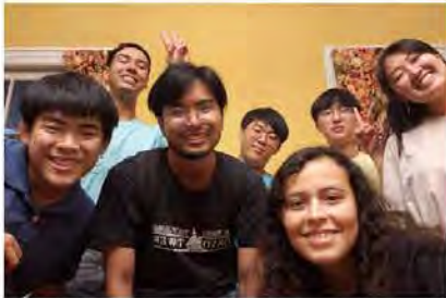
Connecticut University of Bridgeport