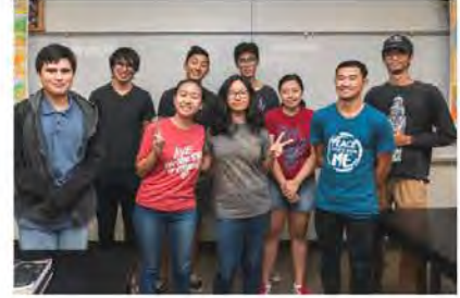
California Cypress College