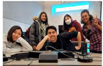
Minnesota University of Minnesota, Twin Cities