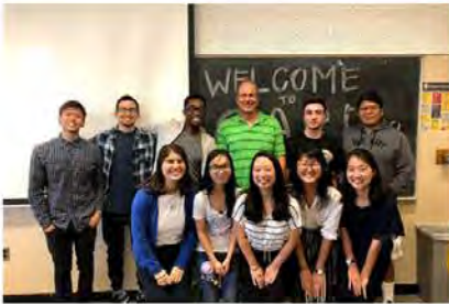
California California State University, Los Angeles