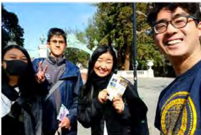
California University of California, Berkeley