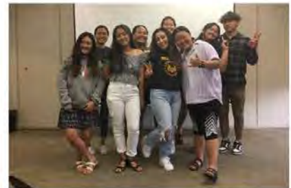
Hawaii University of Hawaii at Manoa