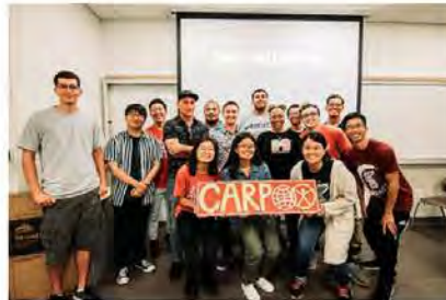
California El Camino College (ECC)