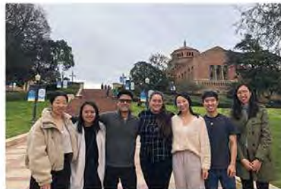
California University of California, Los Angeles