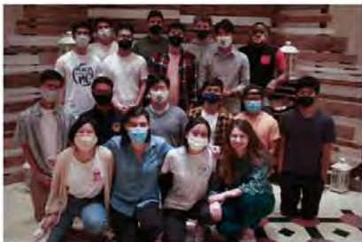
Maryland Montgomery College