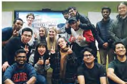
Indiana Indiana University–Purdue University Indianapolis