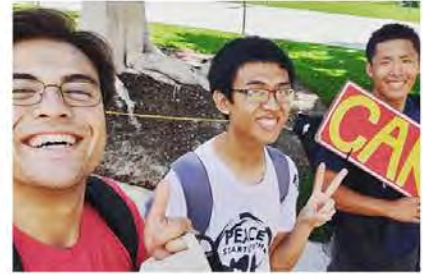
California California State University, Long Beach