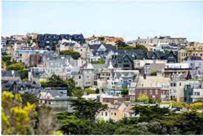
California California State Polytechnic University, Pomona