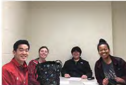
New Jersey Montclair State University