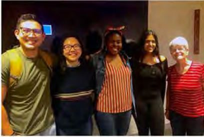
Arizona Arizona State University