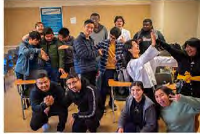
California Chabot College