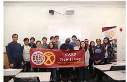
New Jersey New Jersey Institute of Technology (NJIT)