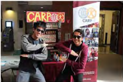
California East LA College (ELAC)