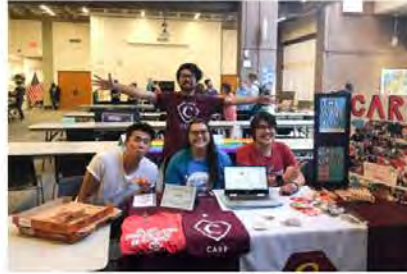
Texas Dallas College, North Lake Campus