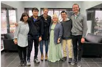
Illinois Harper College