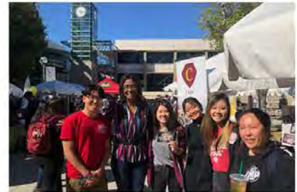
California Pasadena Community College (PCC)