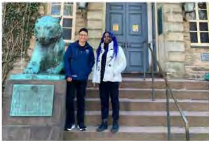
New Jersey Princeton University