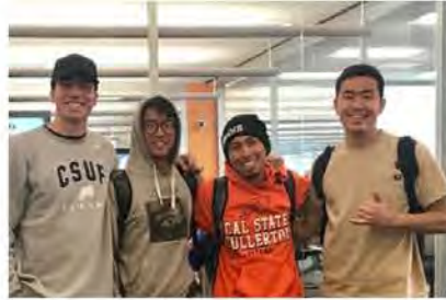
California California State University, Fullerton