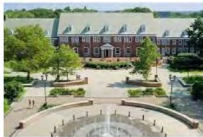
New York Farmingdale State University