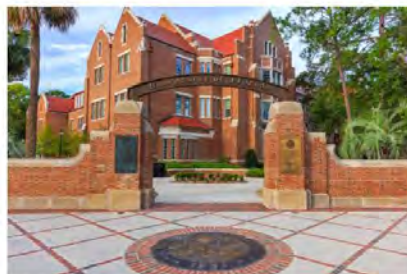
Florida University of Florida