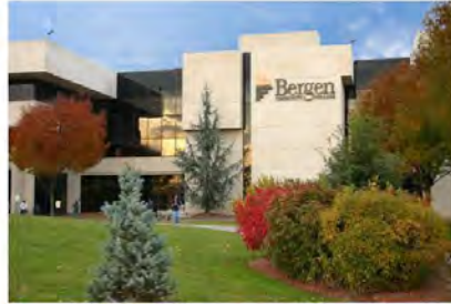
New Jersey Bergen Community College