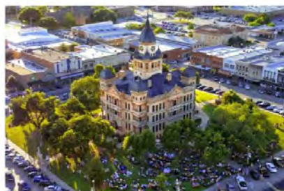
Texas University of North Texas