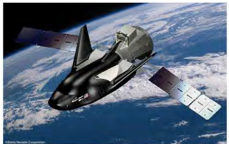
Space utility vehicle: Sierra Nevada's unmanned Dream Chaser is designed to haul 6 tons of cargo to and from the International Space Station.

Eleven months after the Columbia exploded, President George W. Bush announced that the space shuttle program would be shut down once the International Space