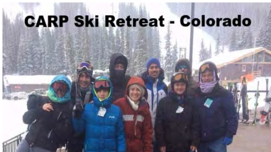
CARP Ski Retreat - Colorado