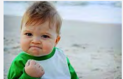
“You can do it!”

2. Mentors help jump-start you to success. The connections, support, and resources made available help give you an edge. Most successful people have had someone help them along the way. Through a mentor, you get access to a whole new network of friends, colleagues, connections, and more.