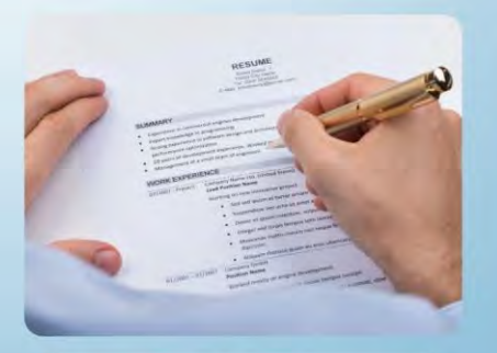
Friday, October 25 10 AM ET